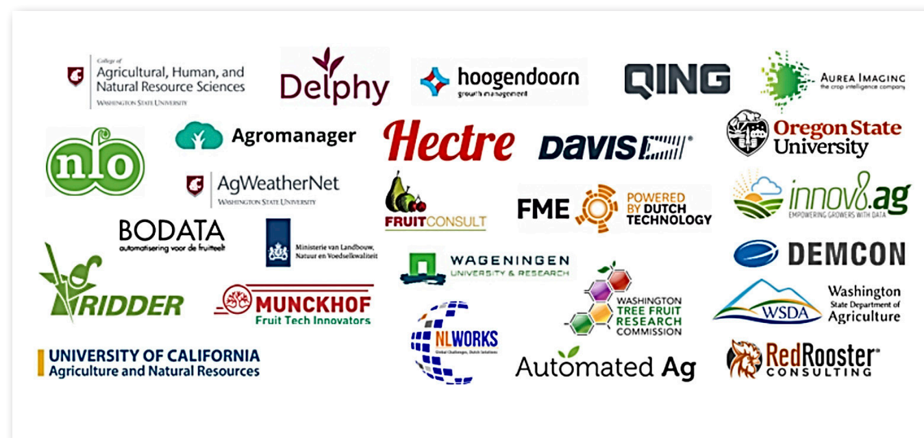
The “Orchard of the Future” collaboration brings together technology companies and research institutions from Washington, Oregon, California and the Netherlands to address growers’ needs for efficiencies and innovation.

Already, the effort has connected Dutch technology companies with Washington