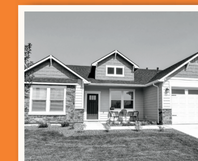
Simplicity SIGNATURE Series Quality HAYDEN HOMES built on-your-land

Home plans to fit every style, budget and need.